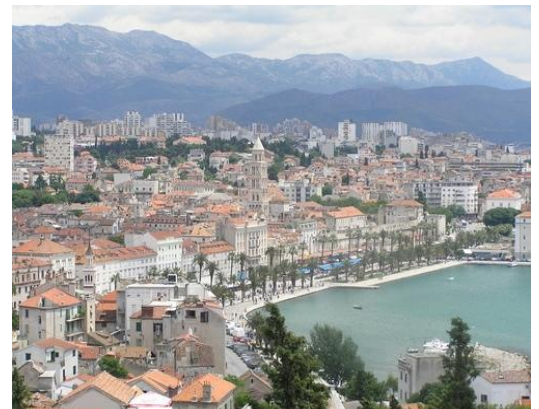
Aerial view of Split, Croatia